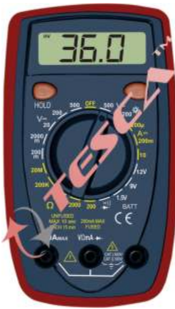
Model No:- 16961 / 16962