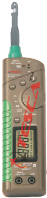
User Changable Pinpoint or Hook Test Leads